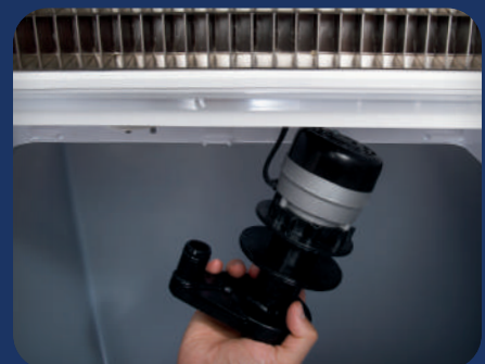
Snap-fit water pump