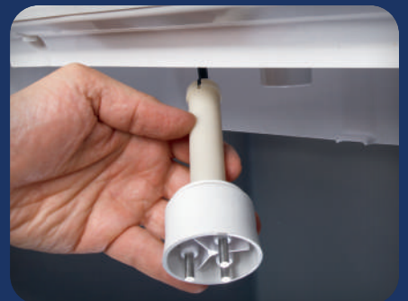
Snap-fit water probe