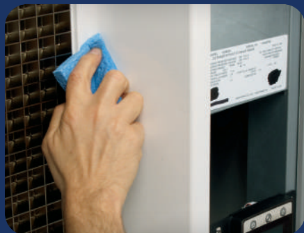
Rounded foodzone corners