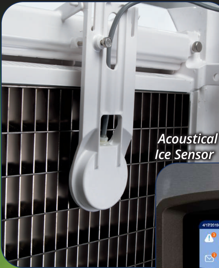
Acoustical Ice Sensor

Indigo NXT is the most efficient cube ice machines on the market today. Many of the new models incorporate R410A refrigerant, which is environmentally friendly and has 48% less global warming potential than previous models. All models are AHRI certified, as well as, exceed the stringent 2018 DOE (Department of Energy) minimums for energy usage. Many models are ENERGY STAR® 3.0 qualified, which makes them available for rebates from local energy companies. Indigo NXT is up to 43% more energy efficient than previous models, significantly lowering the cost of ownership.