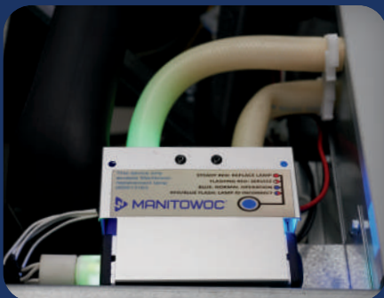
LuminIce II Growth Inhibitor accessory

Indigo NXT coupled with the D-bin ice storage bin, provides added sanitation while transporting ice from the bin to its designated location. The new ergonomic NSF scoop, keeps the thumb and knuckles from touching the ice and is included with every D-bin ice storage bin. The internal scoop holder keeps the handle above the ice, free from contamination. For those occasions when the scoop must be kept outside the bin, there is an optional NSF approved, external scoop holder which keeps the ice scoop covered and conveniently located.