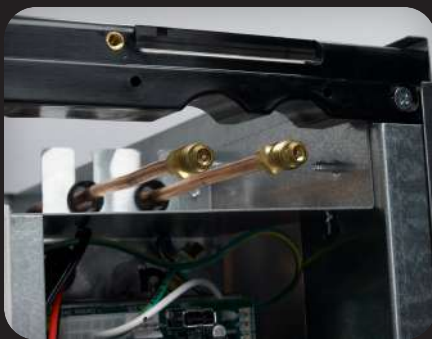
Easy Frontal Service Access Ports