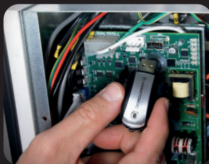
USB Port Firmware Updates