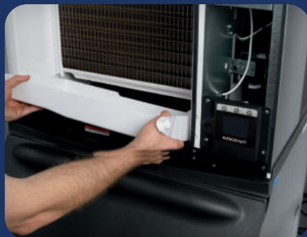
Removable water trough