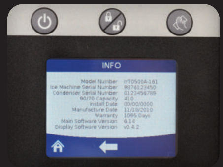
One touch machine info