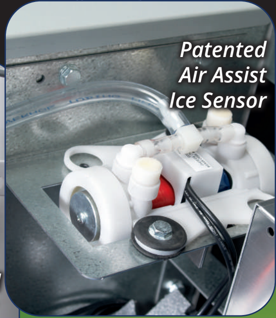
Patented Air Assist Ice Sensor