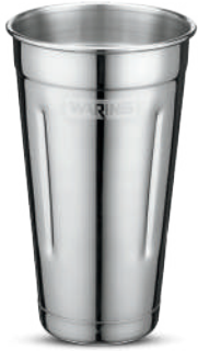
CAC20 Stainless Steel Malt Cup