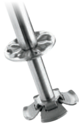
CAC123 Butterfly Agitator (6 pack)