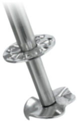
CAC112 Solid Agitator (6 pack)