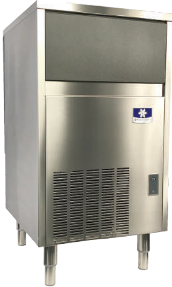
Model USP0100 Square Cube Ice Machine